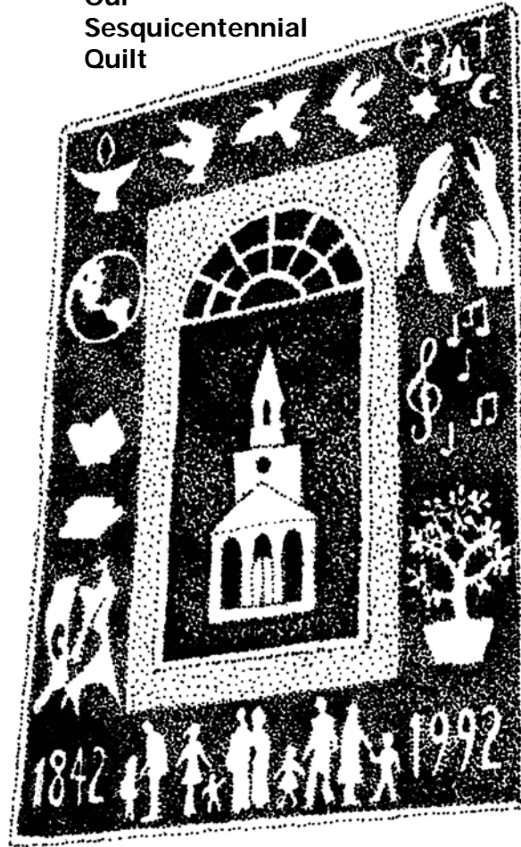
Our Sesquicentennial Quilt